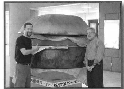
Mmmm. Sasebo Burger!

At this point, it was time to take a side trip to China. Arriving in Macau was fascinating. We drove from the airport over a