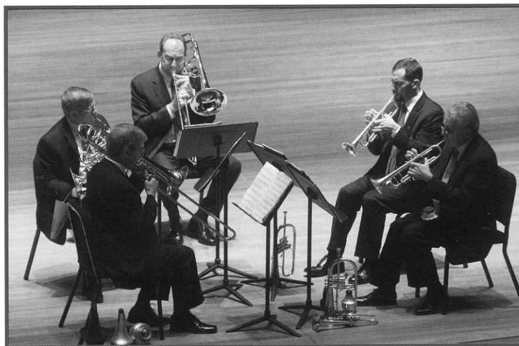
The American Brass Quintet at its 50th Anniversary concert at Alice Tully Hall, Lincoln Center on October 15, 2010.